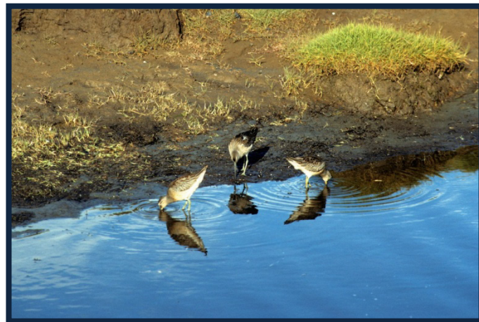
Long-billed Dowitchers ( Limnodromus scolopaceus ) foraging for invertebrate prey.

This work will enhance our understanding of how shorebirds may respond to climate-driven changes, such as changes in food resources, snow cover, surface water, and availability coastal habitats. This knowledge is critical to development of contemporary species-habitat association maps and models that allow managers to explore projections of future shorebird distribution under different climate scenarios.